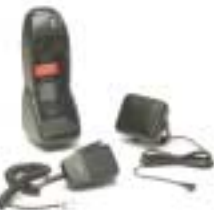
Full Car Kit

For a full range of Accessories, please refer to the Tait Orca Accessories brochure (BOP403-01).