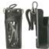
Leather Carry Cases