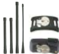
Antennas & D-Clip