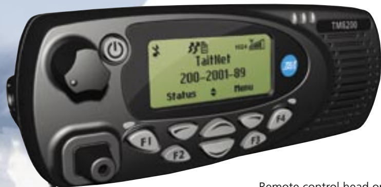
Remote control head option

Customisation is easy with this radio, so you'll save on the cost of integration. New functionality can be added via software upgrade, lowering the cost of ownership and making the TM8255 an excellent long-term investment.